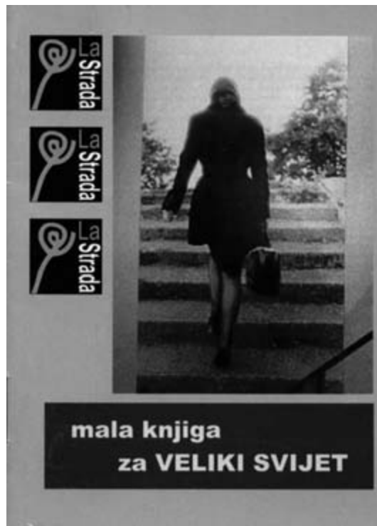
Bosnia Herzegovina (booklet)

Don't get trapped, you have the right to choose. The small book for modern girls.