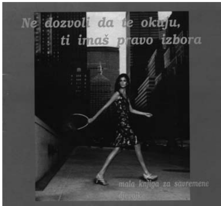
Bosnia Herzegovina (booklet)

Don't get trapped, you have the right to choose. The small book for modern girls.