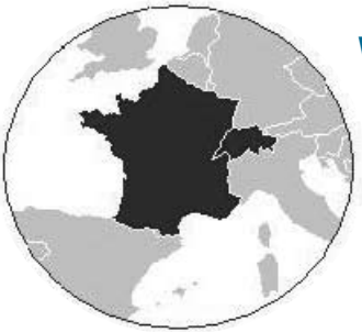
Violations against undocumented migrants' right to family life were reported in France and Switzerland.

Every person has the right to marry, to family life, privacy and protection from arbitrary interferences from the state with regards to these rights.<sup>99</sup> Authorities have nonetheless intruded into many aspects of the private and family lives of undocumented migrants.