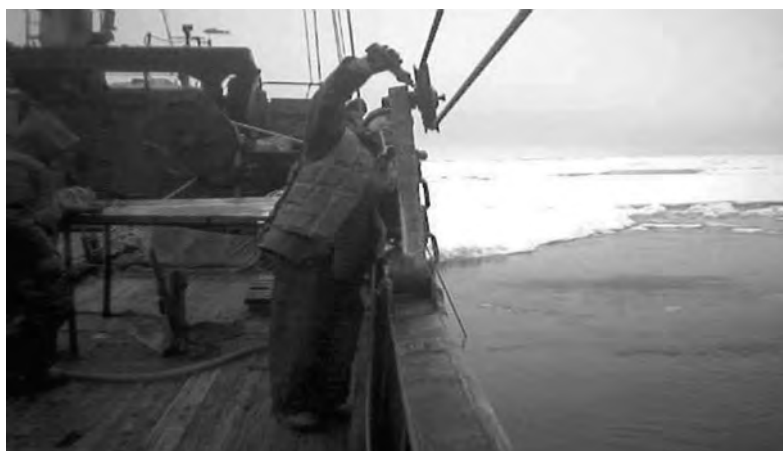
Photo: Ukrainian seafarer trafficked aboard an illegal crabbing vessel in Russia.

At sea they told us the conditions of the contract, which differed completely from the one we signed back in Ukraine... Slavery started literally from the very first day of arrival on board the vessel. The Russians were acting rather aggressively; they considered themselves as seniors as it was not their first experience. There were also some representatives of criminal groups, who were on the Russian federal wanted list. They fled to Japan and managed these two old clunkers from Japan. I cannot think of another word for these two ships than old clunkers. When we arrived and they told us about the new conditions I, as the eldest and more experienced, asked a question: “How can we get home?” We had completely different contract conditions and, since the contract conditions were violated, we were not about to work there. I was told that if we wanted there was a boat that could come and take us from the ship and take us home for 2000USD. Certainly no seafarer had more than 100 or 200USD with him. That is why we had to agree to stay for the minimum period of time that they offered us.