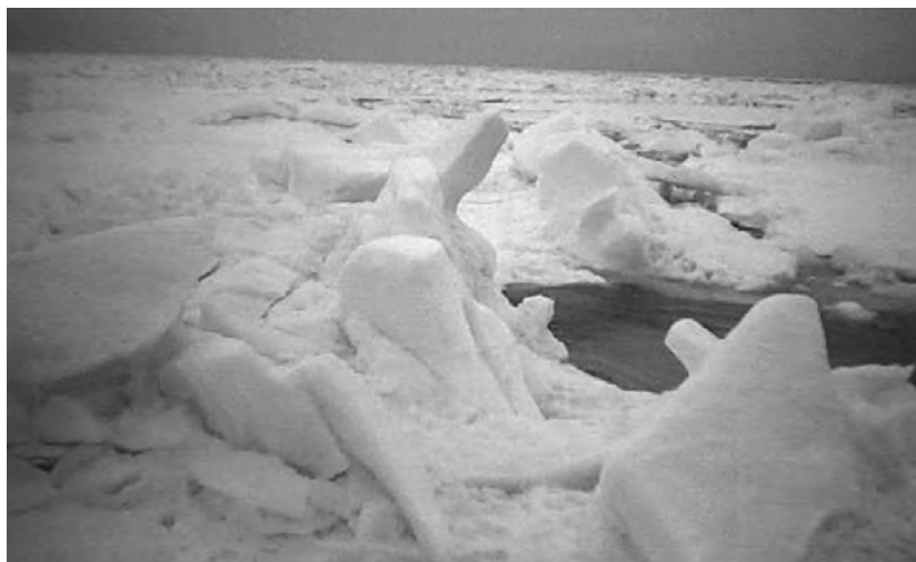
Photo: View of sea and ice floes from illegal crabbing vessel in Russia; trafficked Ukrainian seafarers aboard.

One of the key challenges in the fight to end trafficking is the identification of trafficked persons. “Identification” means coming into contact with trafficked persons in ways that can facilitate their escape from exploitation and give them access to post-trafficking protection and assistance. Identification is difficult because so much trafficking takes place “out of sight”, with traffickers consciously and strategically limiting contact between trafficked persons and others, particularly individuals and organisations that might be able to help them. Other obstacles to identification include language barriers and corruption.