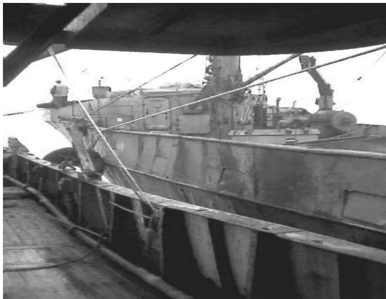
Photo: One of the vessels on which Ukrainian seafarers were trafficked in Russia.

necessary formalities and then they let us pass through customs. We were placed on a very old boat and this agent left without saying a word. On this boat we went to the Pacific. We travelled for about twelve hours.