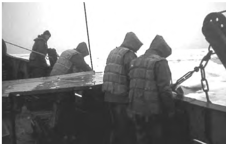
Photo: Ukrainian seafarer trafficked aboard an illegal crabbing vessel in Russia.

from one crab trap to another. It would be about 15 minutes or half an hour, people would just fall down in the corridor dressed, dirty and not washed. I would ask them: “Will you eat?” And they would reply: “No, no, let us have a short nap because we will go to work again and will not have time to rest”. 40