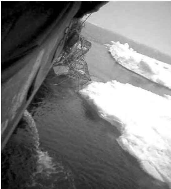
Photo: Dilapidated illegal crabbing vessel in Russia onto which Ukrainian seafarers were trafficked for fishing.

We were taken on a boat to go to sea and embarked on a ship that did not have any sign and name on it... When the boat went, we were told by those who were on board that they were working 24 hours a day, almost without sleep, no money paid and also that it was impossible to leave since the ship never entered port.