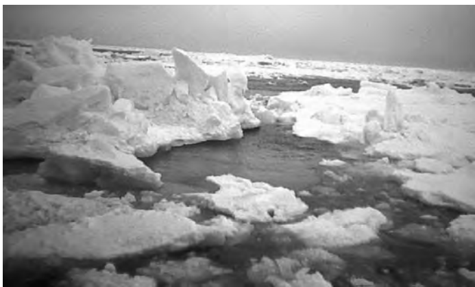
Photo: An ice floe, taken from the vessel on which Ukrainian seafarers were trafficked for illegal crabbing in Russia.

My speciality, I am a cook... I used to order the products myself for the two ships that I recently worked on. I could choose the products. The situation was different. Whereas when we were in slavery, they were bringing us junk and, moreover, it was only half of what was needed. There was no water at all. We used to put some seafarers down on an ice floe; we'd put a hose and pump water to drink.