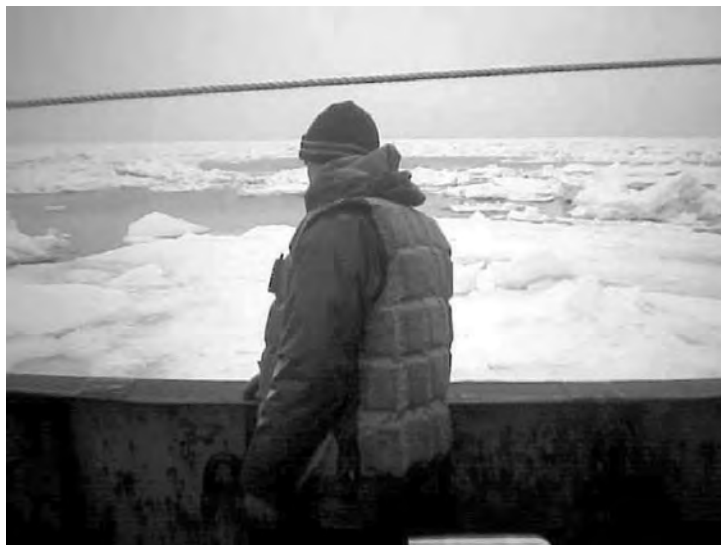
Photo: Ukrainian seafarer trafficked to Russia for illegal crabbing. Photo credit: Anonymous trafficked seafarer.