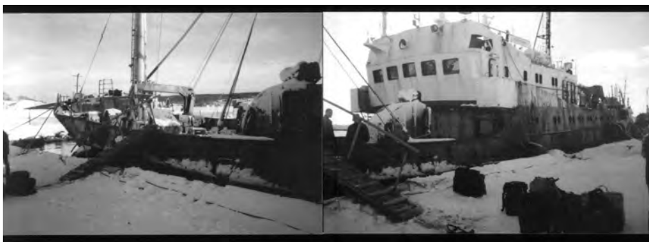
Photo: Russian vessels on which Ukrainian seafarers were trafficked for illegal crabbing.