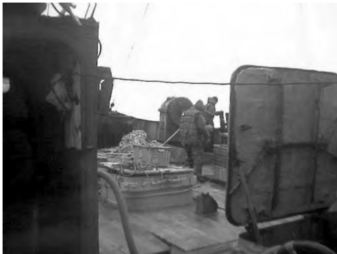
Photo: Ukrainian seafarer trafficked aboard an illegal crabbing vessel in Russia.

The crew began to complain about their health. One sailor had a splitting liver, the other [had problems] in the heart. Many had problems with their gums and teeth.