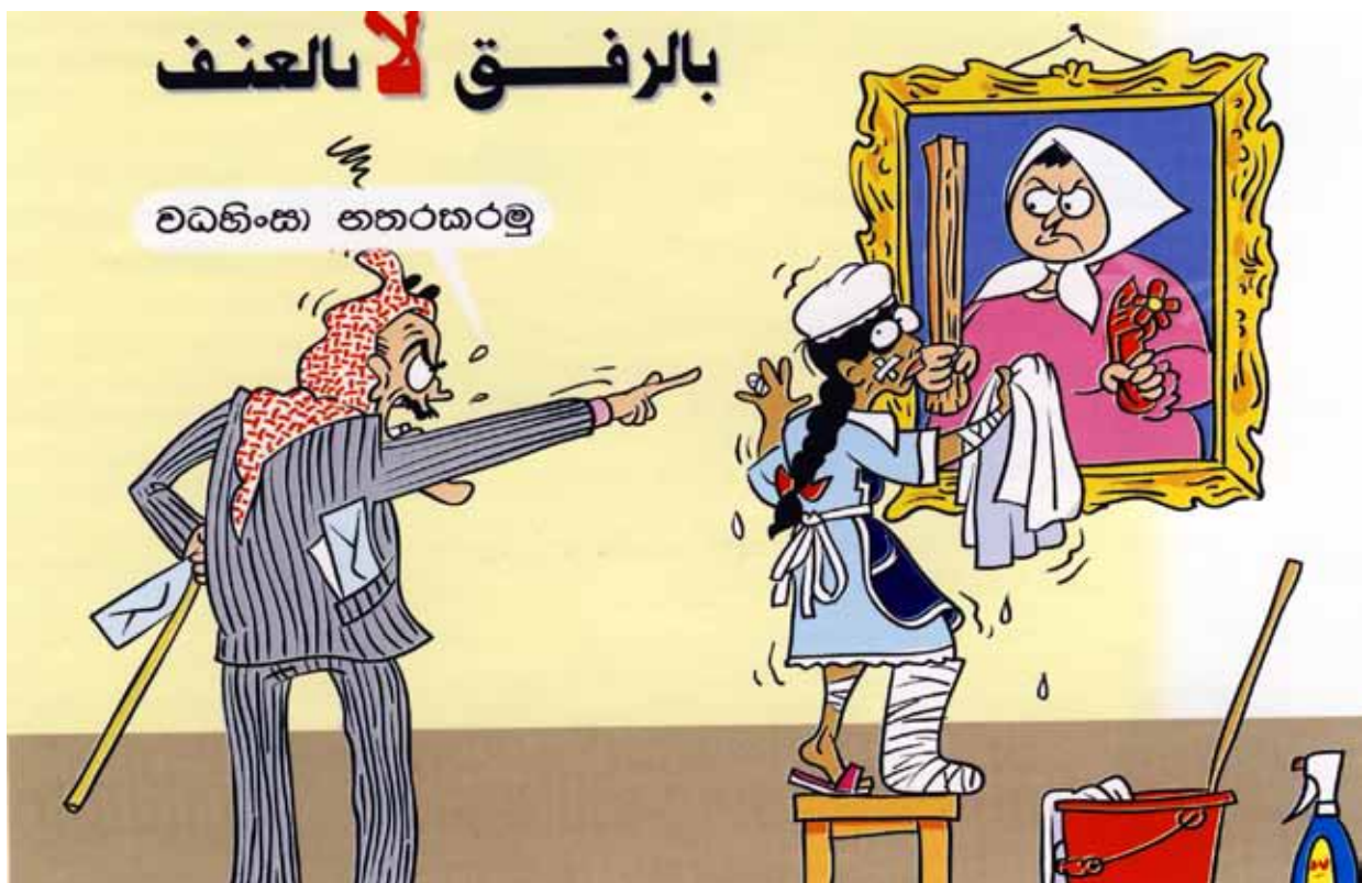
→ UNIFEM - Abou Mahjoob

In August 2009, the Filipino government organised the repatriation from Saudi Arabia of 44 Filipino women that had been living in a shelter for months. They were part of a group of 127 Filipino women, mostly domestic workers, who had fled their workplaces, complaining of mistreatment, long working hours, insufficient food, and non payment of wages. (HRW)